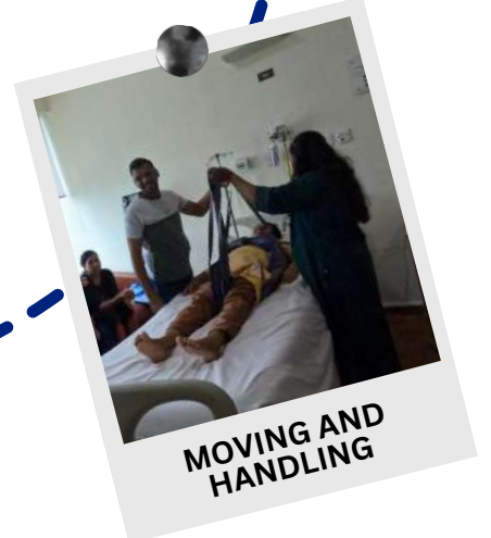
MOVING AND HANDLING