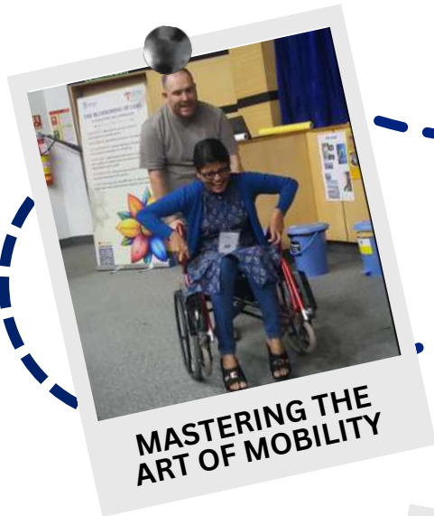
MASTERING THE ART OF MOBILITY