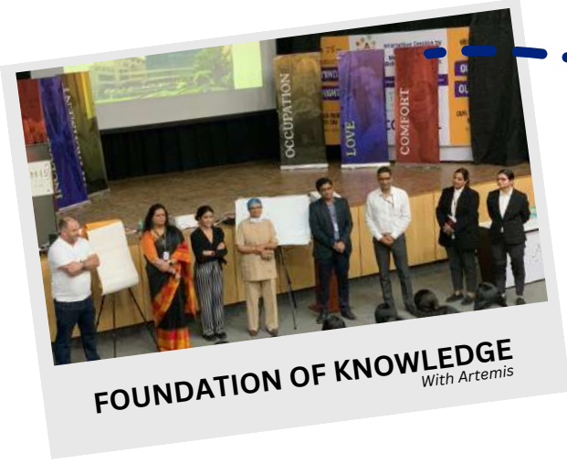
FOUNDATION OF KNOWLEDGE With Artemis