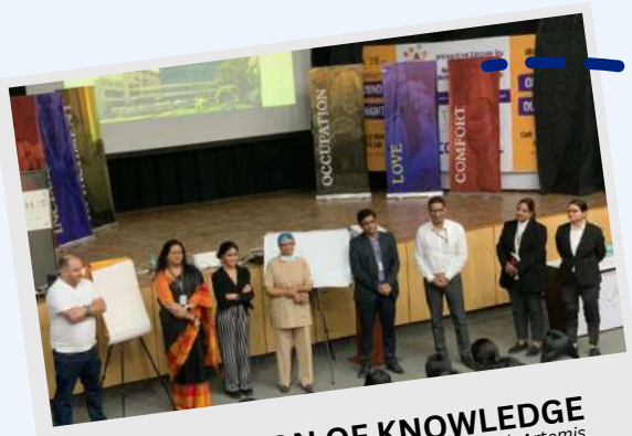
FOUNDATION OF KNOWLEDGE With Artemis