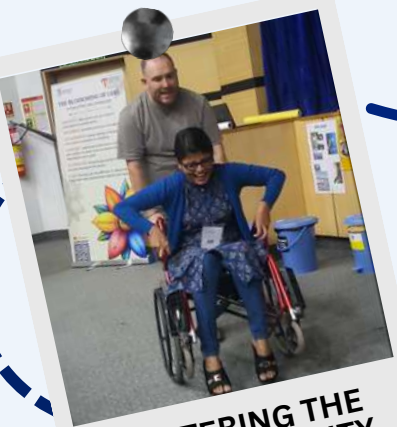
MASTERING THE ART OF MOBILITY