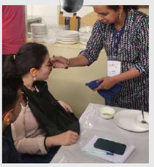
FEEDING THE HEART, FEEDING THE SOUL